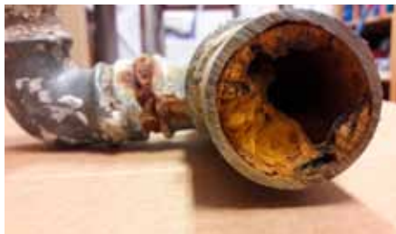
Water pipelines that are more than 50 years old can close up almost entirely, weakening water quality.

The boundary for liability for the water pipeline network between the property and the water utility lies in the water mains or at the water service valve. The liability boundary for wastewater and storm water is at the main sewer or connection manhole. Backflow valves or pumping stations in basement spaces are also the property's responsibility. If sewage floods into the spaces below backflow prevention height, the property is solely responsible for the damage caused by the flood.